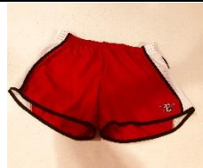
Ladies Shorts $23