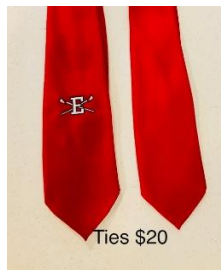
Mens ties $20