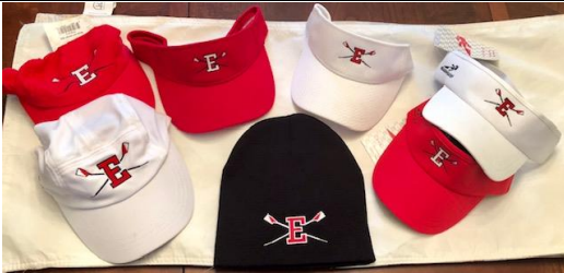
Headsweat Racing Hats and Visors (Red / White) $23