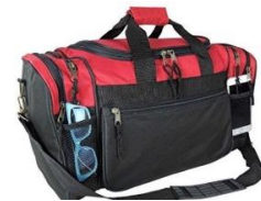
Embroidered Team Duffel (TBA)