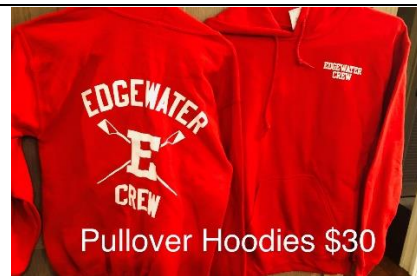
Pullover Hoodies $30