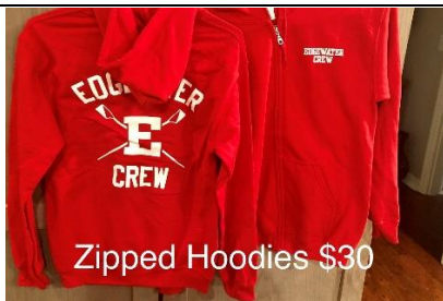
Zipped Hoodies $30