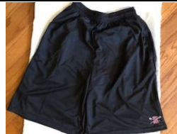
Mens Shorts $18