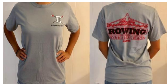
Spirit t-shirts $25 ( New T-shirts and Tanks TBA)