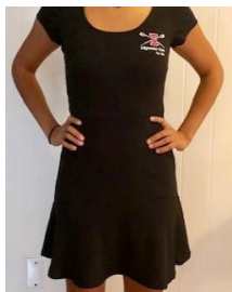
Ladies Spirit Dresses $25